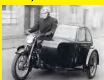
The Ascot was a sidecar saloon

Watsonian celebrated their centenary in 2012.